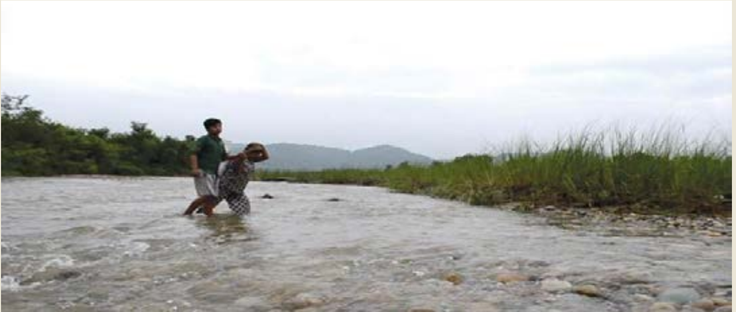
Villagers carefully cross a flood-swollen river in the Madi Valley