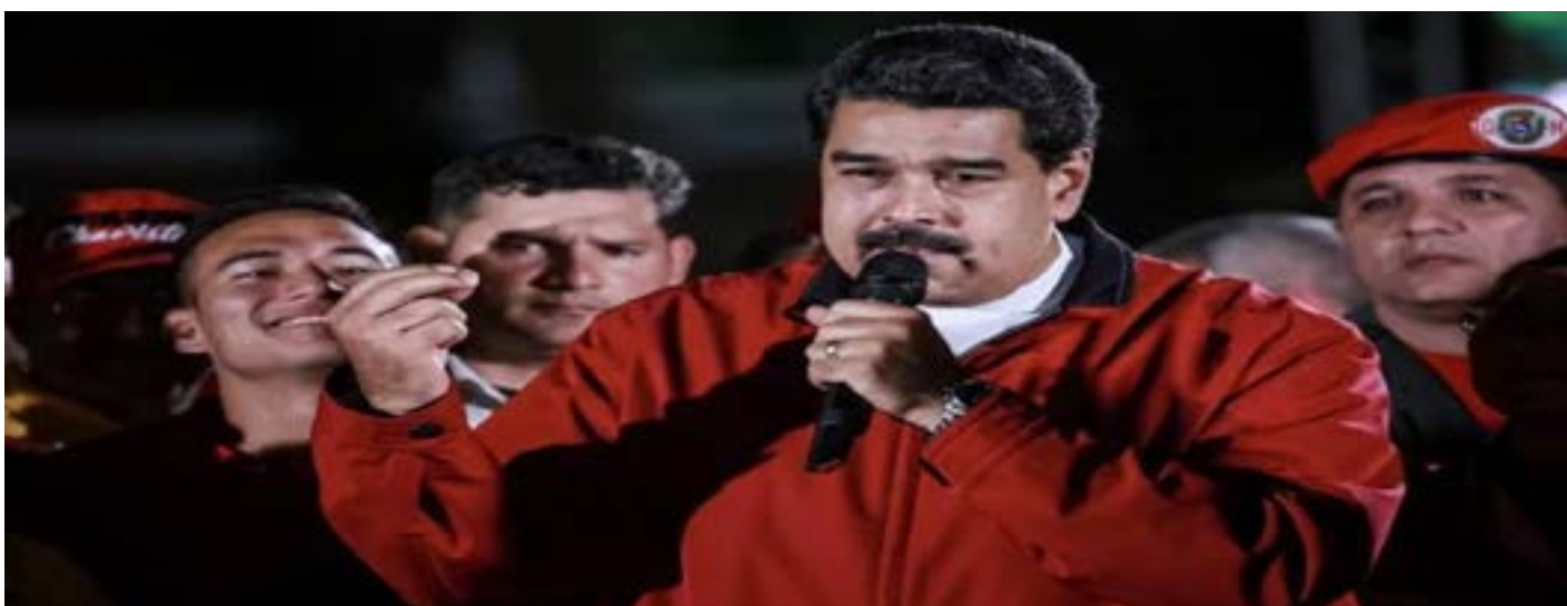
Venezuelan President Nicolas Maduro celebrates election results after a national vote on his proposed Constituent Assembly at Plaza Bolivar in Caracas

In Venezuela, the government of President Nicolás Maduro has had a constitutional assembly elected in what is widely viewed as an attempt to enable it to continue to hold power. The vote has been largely denounced as fake. The government is arresting opposition figures and bloodshed is occurring on the streets of many cities as government forces attempt to suppress resistance. The US Government has branded Maduro a dictator and imposed sanctions on him. About 120 people have been killed in more than four months of violence.