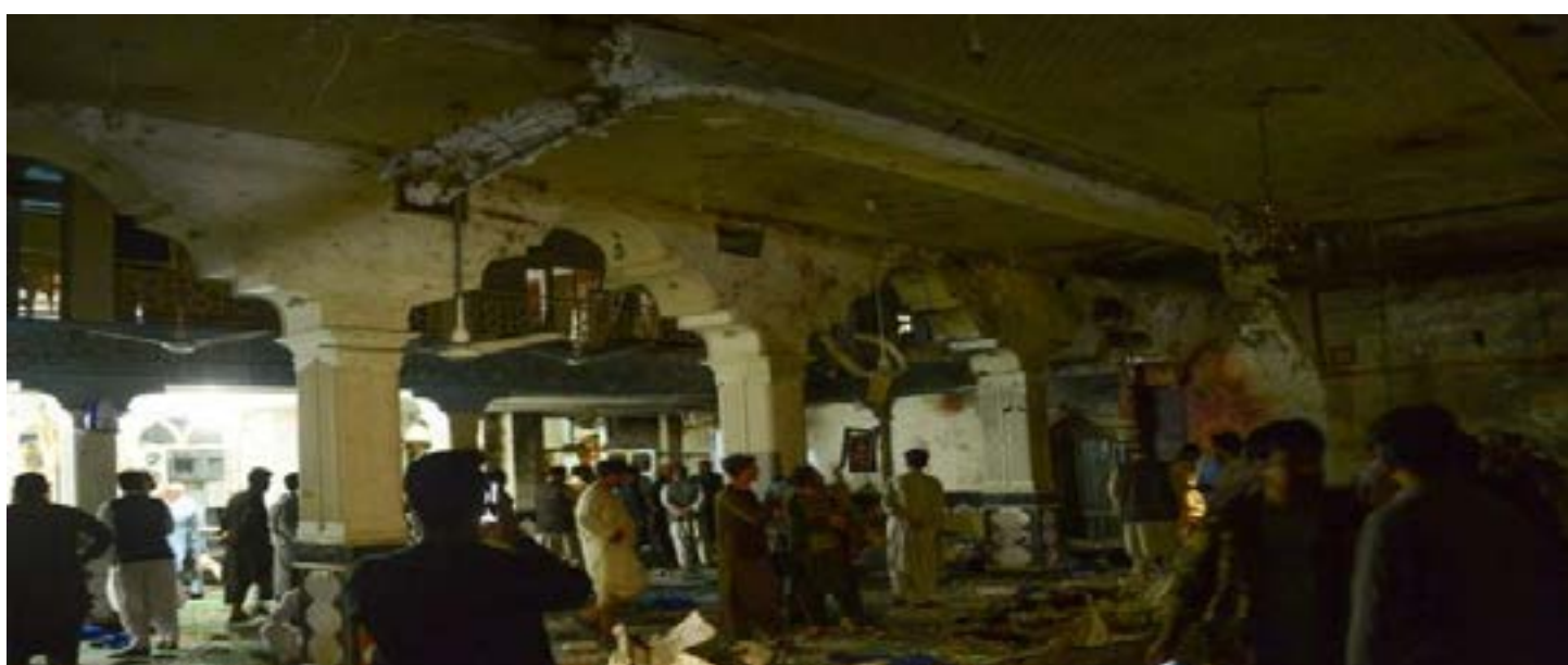
An explosion at a mosque in the Afghan city of Herat has killed about 30 people and injured dozens more.

In the Philippines, the Army continues to battle to recapture the city of Marawi in Lanao del Sur province of the Autonomous Region of Muslim Mindanao, captured by Islamic militants in early May. The Army claims to have killed over 500 insurgents. ISIL linked militants are holding between 80-100 hostages, mostly in a mosque.