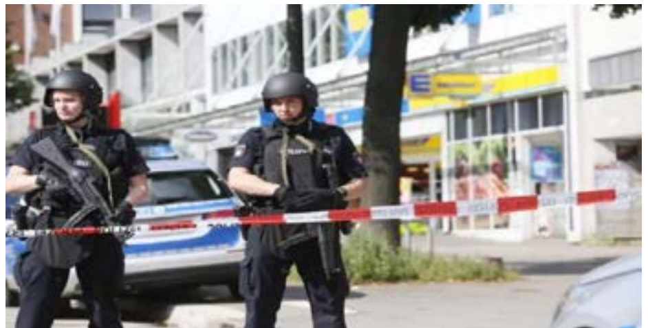
Police officers secure the area after a knife attack at a supermarket in Hamburg.

On 29 July, an Islamic extremist killed one person and injured seven others in a knife attack in Hamburg.