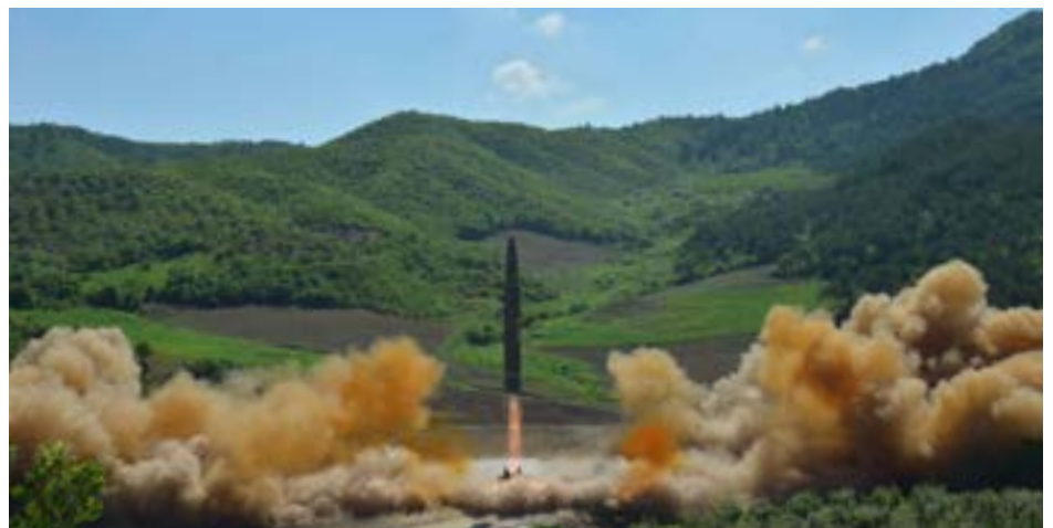
Pyongyang has reportedly launched another missile on July 28, 2017, which landed in the Sea of Japan.

North Korea continues to fire missiles into the Sea of Japan, and claims now to have a nuclear armed ballistic missile capable of hitting the United States of America. Tension has risen.