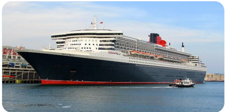
QUEEN MARY 2

We publish this month a photograph of The Queen Mary 2 of Cunard Cruise Line.