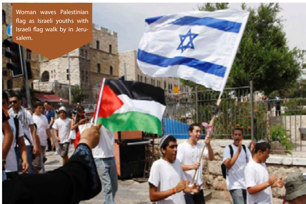
Woman waves Palestinian flag as Israeli youths with Israeli flag walk by in Jerusalem.

Speeches by senior Israeli politicians indicating that areas of Jerusalem sacred to Muslims should be reserved for Jews have caused a resurgence in violence and fears of a further uprising, or intifada. Israeli settlement in Palestine areas continues to reduce the area that might be available to any Palestinian state, increasing friction. The recent victory of the right wing republican party in the US congressional elections will give encouragement to Israeli refusal to offer compromises to the Palestinians and will increase the chances of further violence.