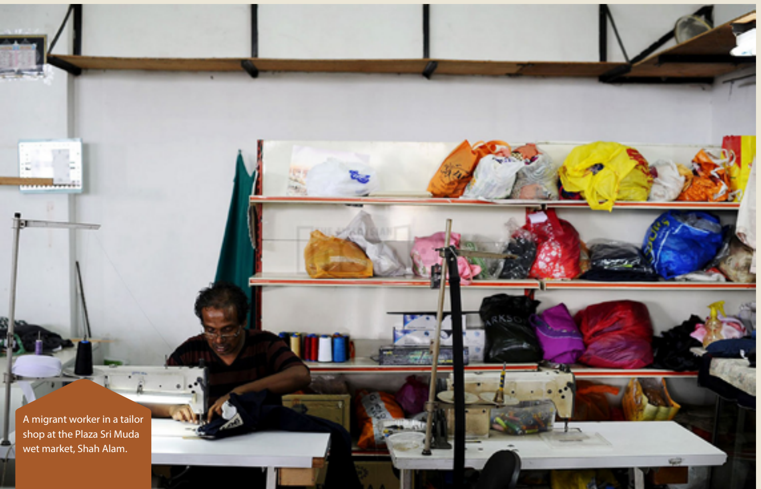
A migrant worker in a tailor shop at the Plaza Sri Muda wet market, Shah Alam.

Malaysia is largest labour destination for Nepali workers. Around 700,000 of total 2.5 million Nepali migrant workers are employed there. Stakeholders attribute the increasing number of deaths to appalling working condition, climate, lack of medical care and compulsion to work under immense stress, though there has been very little research on the matter. Doctors said most of the deaths could be avoided through healthy lifestyle and by ensuring better work environment, food, adequate rest and regular health check-ups.