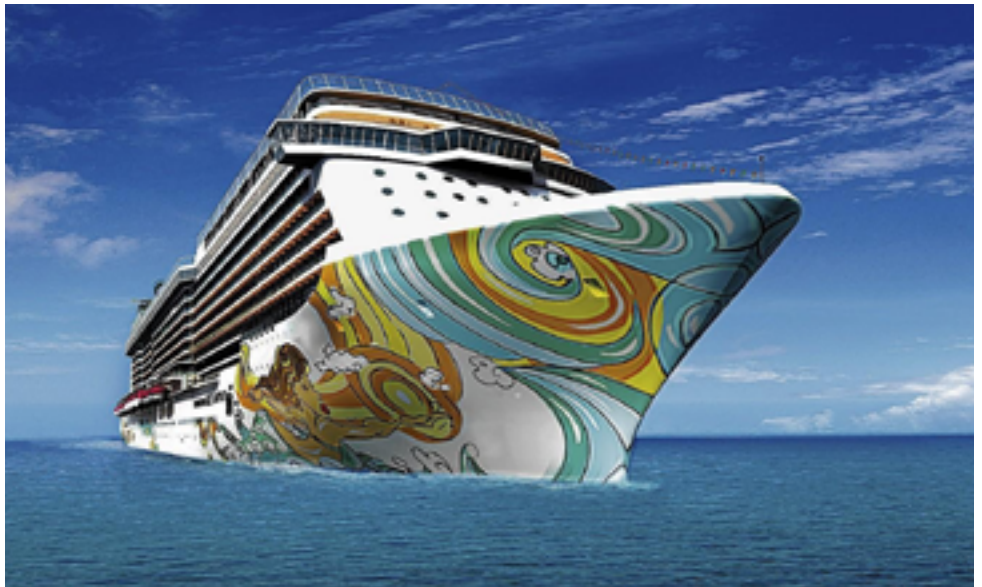
The Norwegian Getaway of Norwegian Cruise Lines

If you have pictures or postcards of your ship, please send them in to us for future Newsletters.