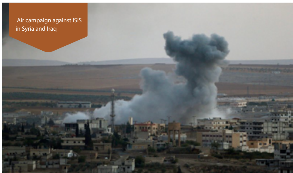
Air campaign against ISIS in Syria and Iraq

The air campaign launched over a month ago against the Islamic State (ISIS) in Iraq and Syria by the United States and its Arab, Australian and European allies has continued. Aircraft continue to bomb ISIS and this has halted ISIS expansion. The Kurds in the Syrian town of Kobani has held out and continues to resist an ISIS siege. Iraq continues to experience Sunni Muslim terrorism across the country. Syria remains engulfed in civil war, as the Assad regime takes advantage of US airstrikes against ISIS to recover ground lost to the insurgents. In Yemen, tribal and religious violence continues to affect the capital, Sanaa, and other areas. The elected Libyan government is now in exile in the eastern city of Benghazi, leaving Islamist militias allied to the city of Misurata in control in the capital, Tripoli. Libya's oil production is being crippled by the violence.