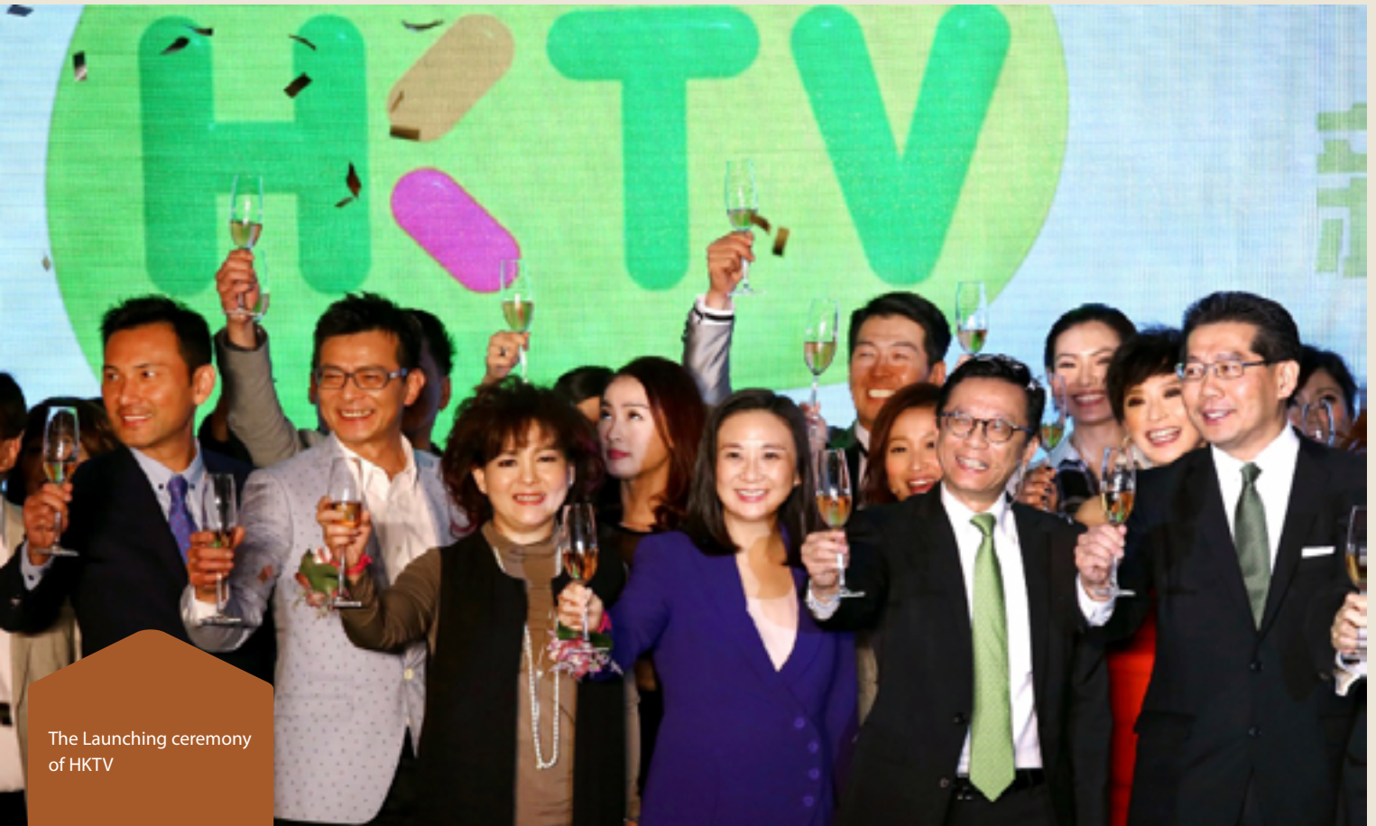
The Launching ceremony of HKTv