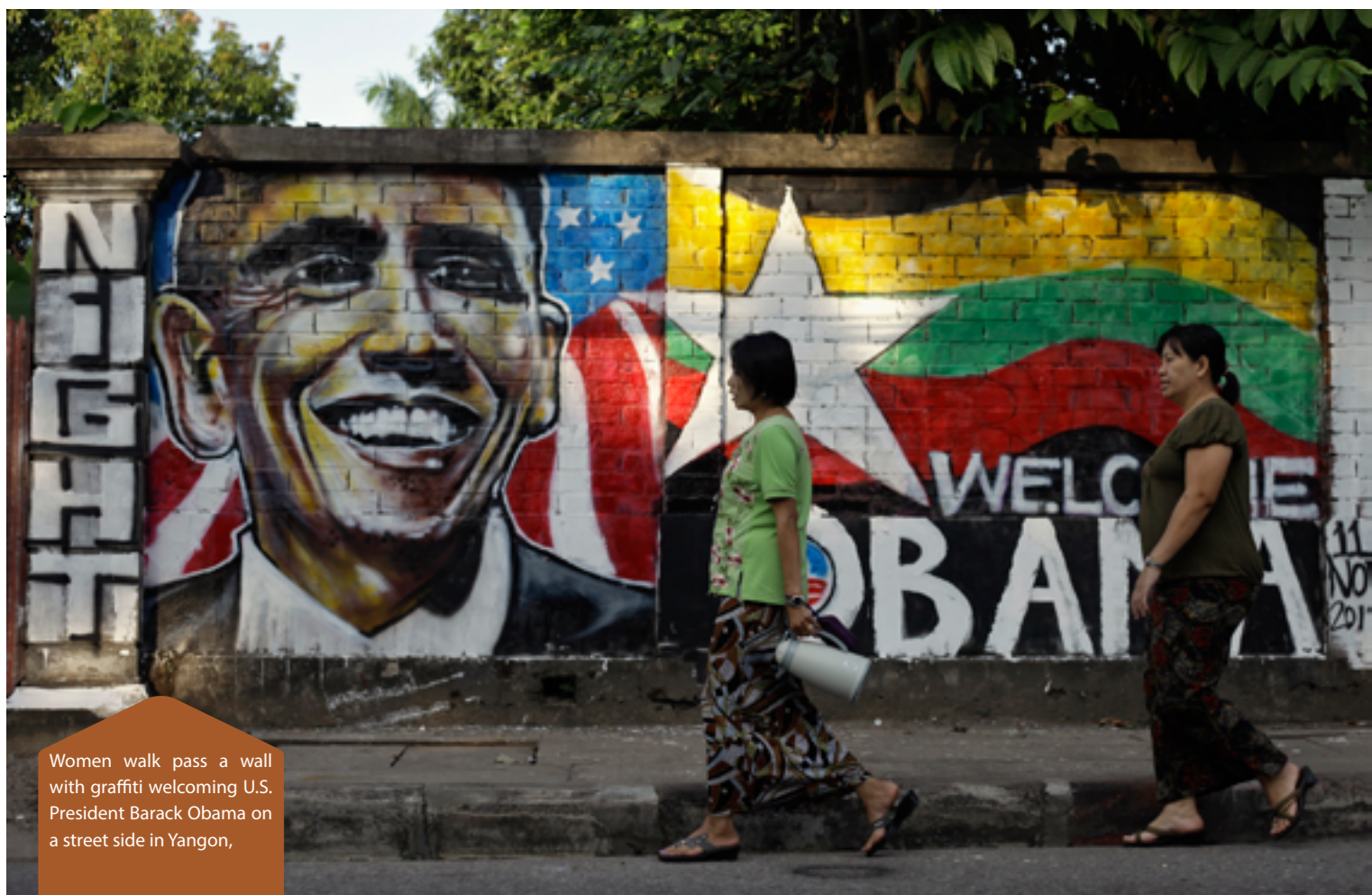
Women walk pass a wall with graffiti welcoming U.S. President Barack Obama on a street side in Yangon,

President Obama visited this month against a background of growing international unease that reforms have stalled in the country. The Muslim Rohingya community in the north-western state of Rakhine has begun to flee the country when it can to avoid dispossession and oppression; 100,000 are estimated to have fled to Malaysia and Bangladesh over the last two years. Many remain in camps outside the provincial capital of Sittwe or in restricted rural villages. Only those able to prove they lived in the country before 1948 are eligible for citizenship, and this has made it impossible for most, who have no documents.