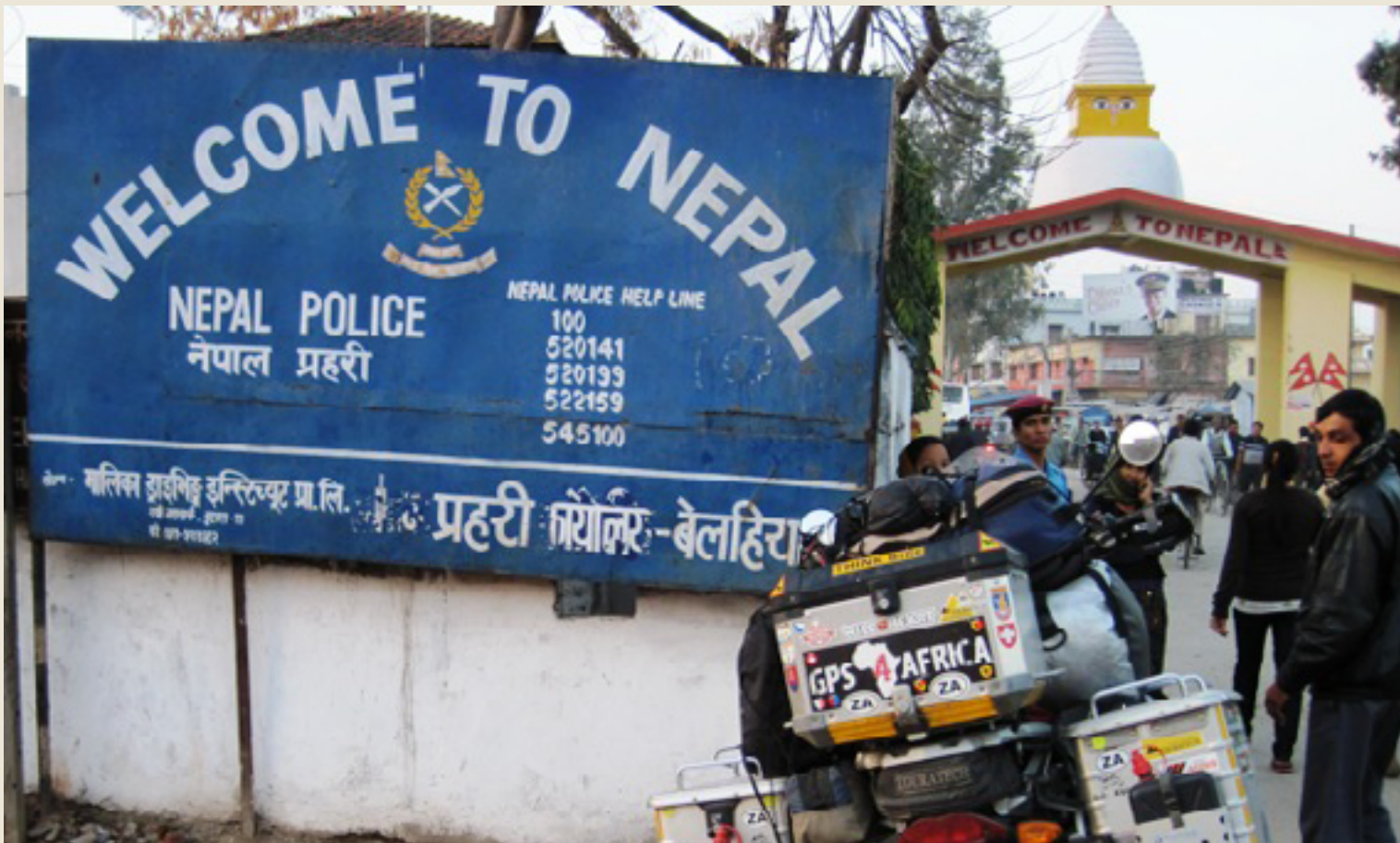
Nepal-India border meeting concludes that joint efforts were needed to curb criminal activities in both countries.