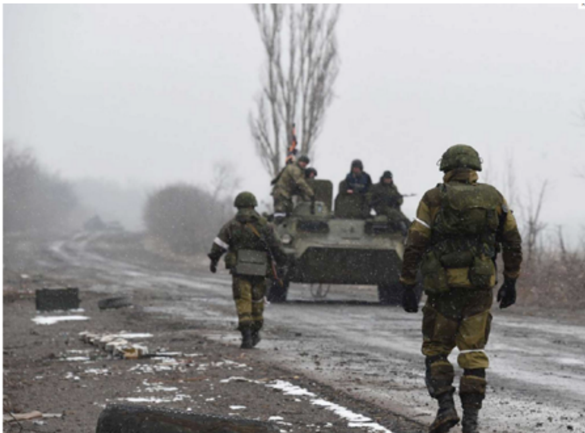
Pro-Russian soldiers walk along a road near contested town of Debaltseve earlier in February.

There is little news of a security note this month.