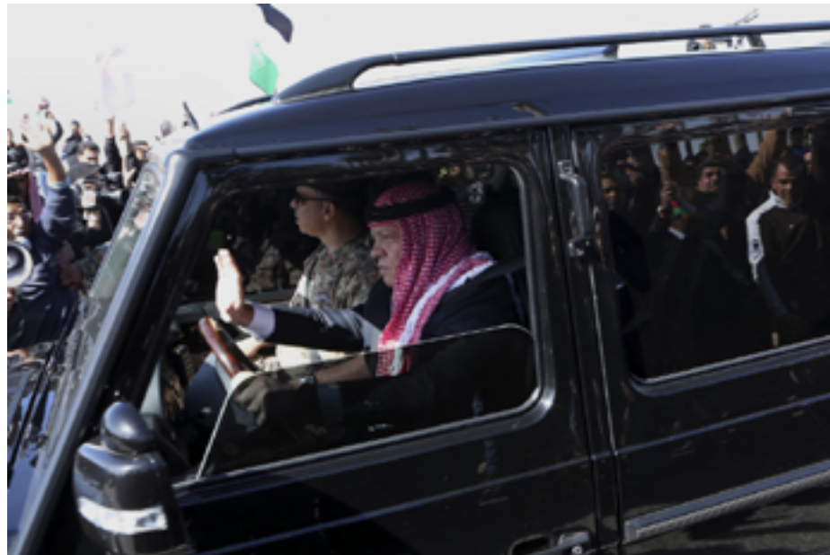
Jordan's King Abdullah II drives through a crowd after cutting short a US trip to rally support against the Islamic State.

The Thai military continues to run the country and has announced that it will prosecute the previous Prime Minister, Yingluck Shinawatra. The Muslim insurgency in southern Thailand, near the Malaysian border, continues. In Malaysia, ex-Deputy Prime Minister Anwar Ibrahim, leader of opposition People's Justice Party, lost his appeal against conviction for sodomy in what most observers regard as a politically motivated trial, and will spend the next five years in jail.