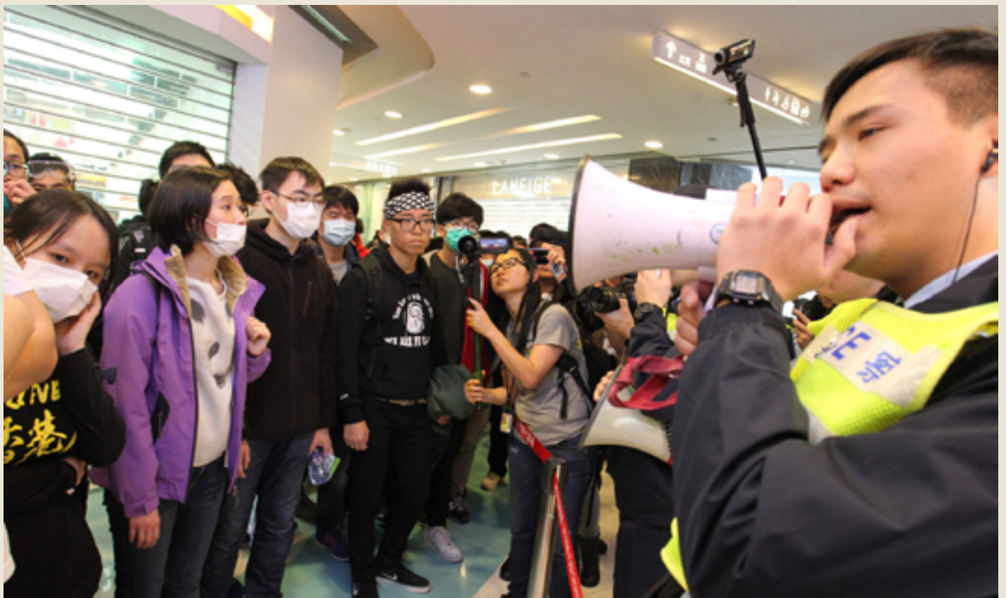
Police officers had to intervene in order to calm rally participants during the Tuen Mun parallel trader protest.

He said the virus could not survive when the temperature ranged between 22 and 27 degrees Celsius, which meant there could be another peak season in the hot months of June and July.