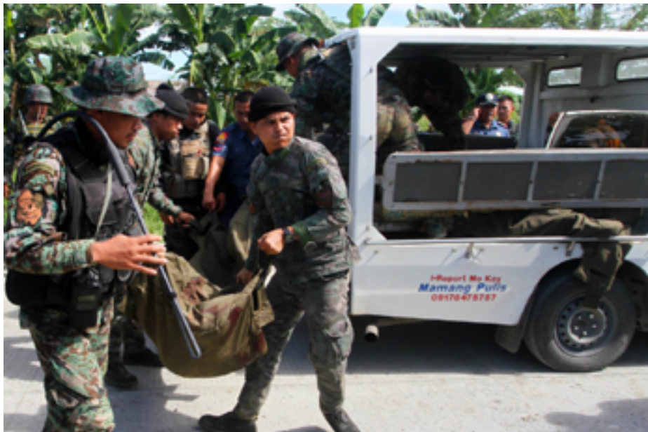
Philippines police commandoes unload body bags containing the remains of their comrades killed in a clash with Muslim rebels.

There is no news of the conflicting maritime claims of China and its neighbours this month. Occasional terrorist acts continue to occur in Muslim areas of western China's Xinjiang province. In the southern Philippines, fighting continues between government forces and dissident Muslim rebels opposed to an autonomy deal between the government and the Moro Islamic Liberation Front, the largest Muslim rebel group in the country. Atrocities aimed at locals, including a bomb attack on a bus that killed 10 and injured over 30 in Bukidnon province in Mindanao in December, have caused many to flee their homes. On 25 January, 44 Philippines soldiers were killed in a gun battle with the Moro Liberation Front, when they attempted to arrest one of Southeast Asia's most-wanted terror suspects, Malaysian Zulkifli bin Hir or Marwan, whom the Moro guerillas were hiding.