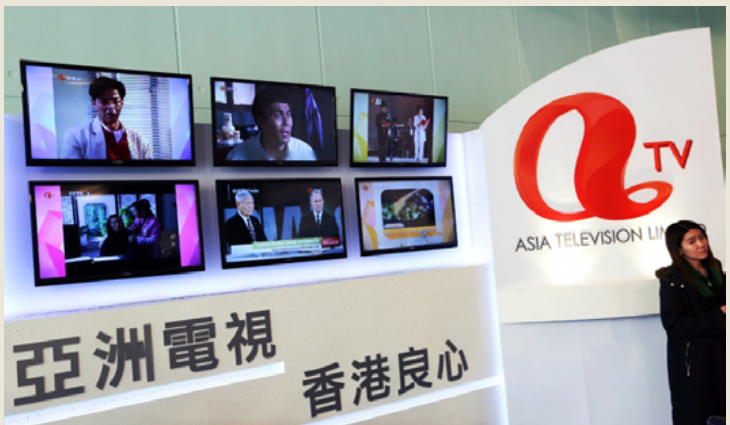
ATV faces a struggle for survival.

However, ATV did not pay the provisional variable fee on time and committed repeated breaches of the same requirement.