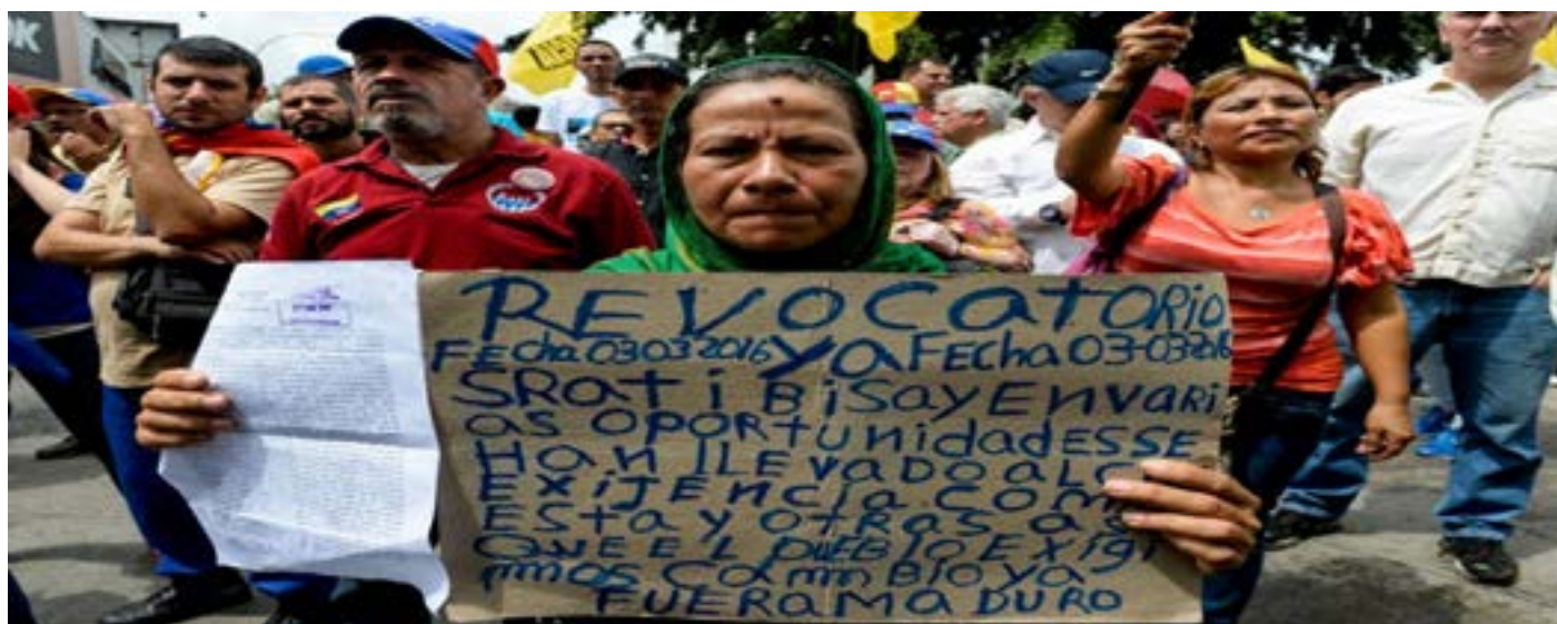
Opponents of the government of Venezuelan President Nicolas Maduro take part in a demonstration in Caracas on May 14, 2016. Venezuela braced for protests Saturday after Maduro declared a state of emergency to combat the "foreign aggression" he blamed for an economic crisis that has pushed the country to the brink of collapse.

Venezuela continues its slide towards bankruptcy and civil disorder. In Brazil, moves continue to impeach the president. Dilma Rouseff amid an economic crisis in the country.