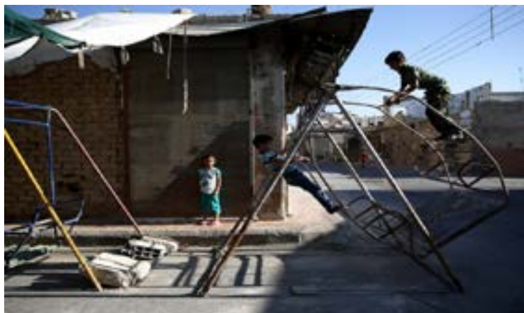
Children play on swings on the first day of the Muslim holiday of Eid al-Fitr, which marks the end of the holy month of Ramadan, in the rebel held Douma neighborhood of Damascus, Syria July 6, 2016.

Conflict has not yet ended in Libya or Yemen.