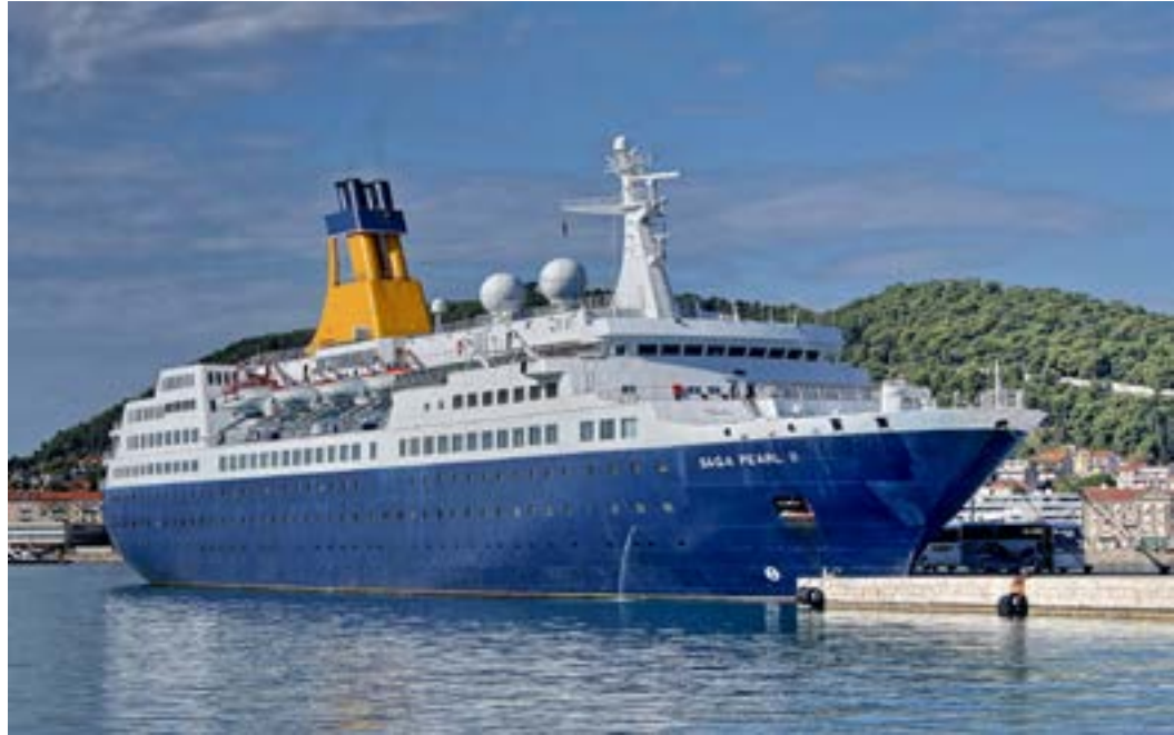
We publish this month a photograph of the Saga Pearl II of Saga Shipping - V' SHIPS .

If you have pictures or postcards of your ship, please send them in to us for future Newsletters.