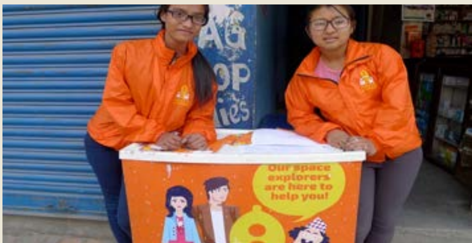
Marie Stopes's Rockets and Space sex education programme in Nepal.