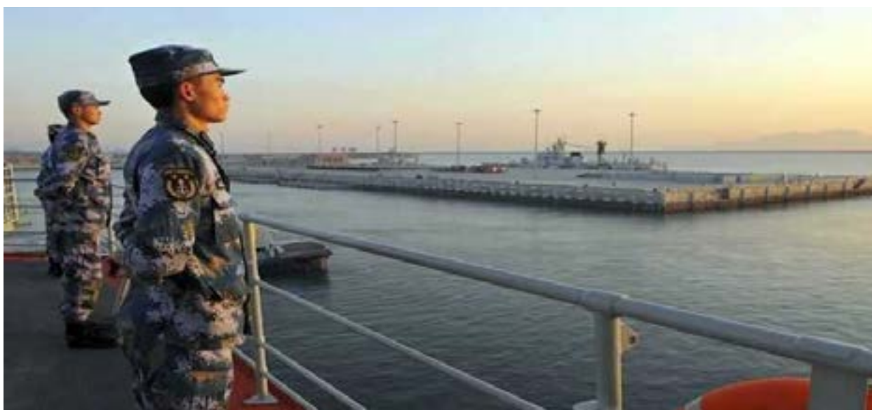
China began a week of naval exercises in waters around the Paracel Islands. China asserts sovereignty over almost all of the resource-rich South China Sea despite rival claims from Southeast Asian neighbours.

Tension continues in the areas of the Spratly and Paracel Islands in the South China Sea, which are all claimed by China, Vietnam, the Philippines, Brunei, Indonesia and Malaysia, and in the Sea of Japan around islands claimed by China, Japan and South Korea. China's insurgency problems in the Muslim areas of far-western Xinjiang province and in Tibet continue. The Black Flag Movement, an ISIS-linked group, continues Muslim terrorism in Mindanao in the southern Philippines, and terrorist recently hijacked an Indonesian ship in the area.