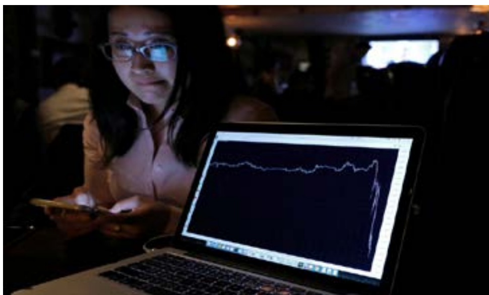
A woman watching the Brexit vote in The Churchill Tavern reacts as a graph shows the British Pound falling in value following the announcement that Britain would leave the European Union, in New York

In Ukraine, tensions with Russia remain high.