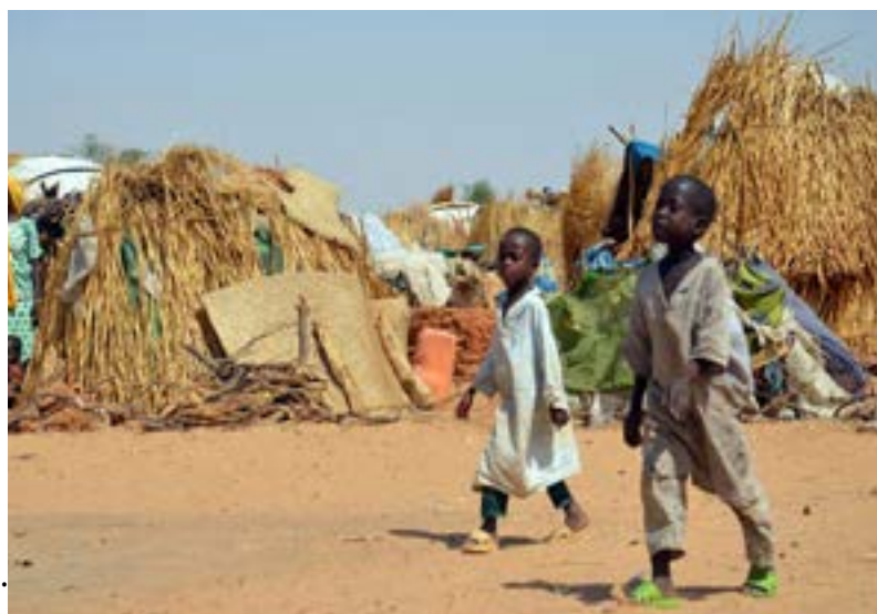
Children walk inside the Assaga refugee camp near Diffa in the south-east of Niger.

There is little news of a security nature this month.