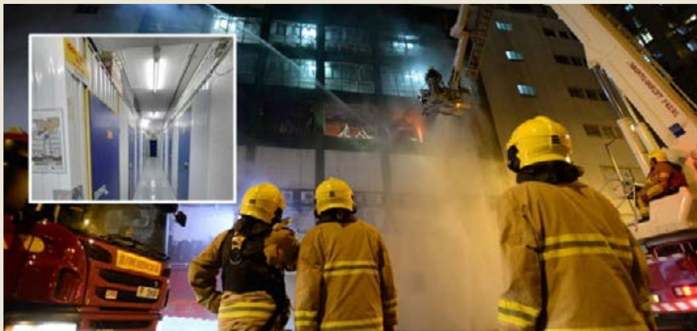
Firefighters had to use aerial ladders to put out the fire at the Amoycan Industrial Center on Ngau Tau Kok Road in Kowloon Bay on Tuesday; SC Storage facility where the blaze started.

It was also learned that the mini storage units are not covered by insurance, although SC Storage promised to compensate the affected renters.