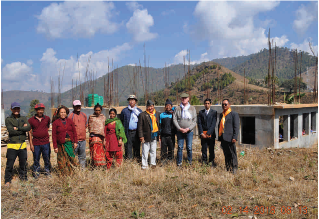
School Staff and Visitors