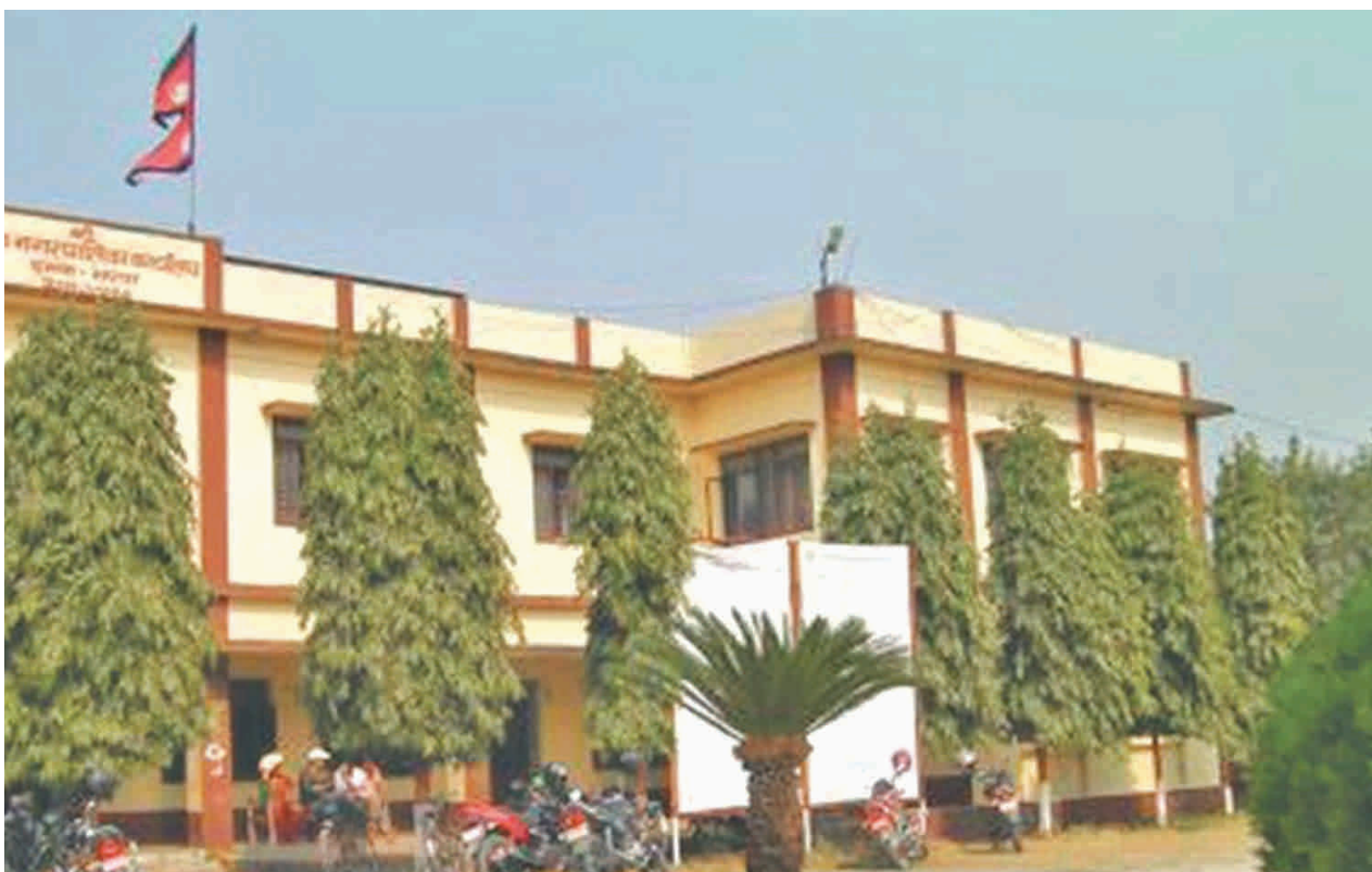
A general view of Damak Municipality office.