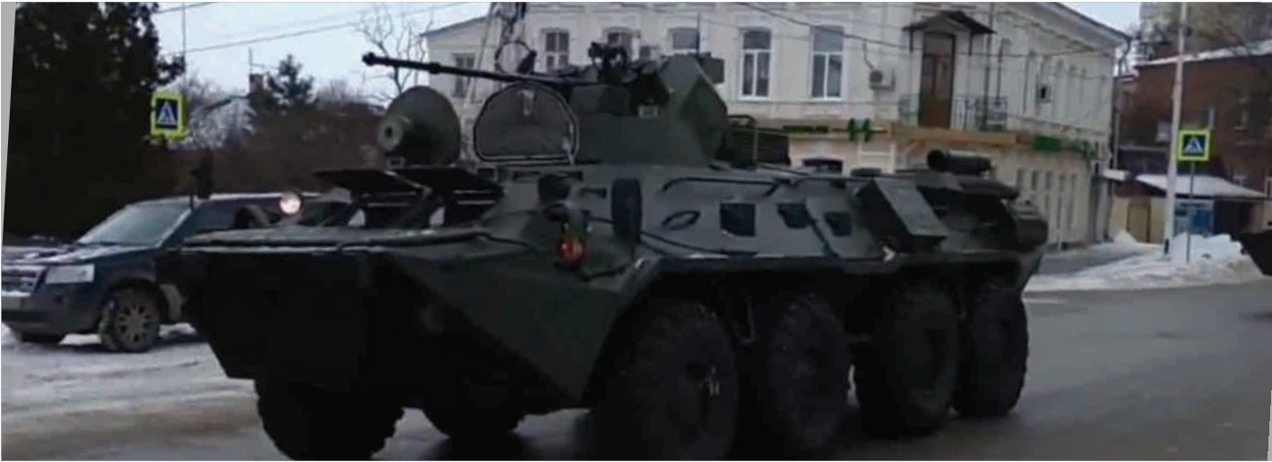
Convoy of military hardware spotted in Russia, near Ukraine border