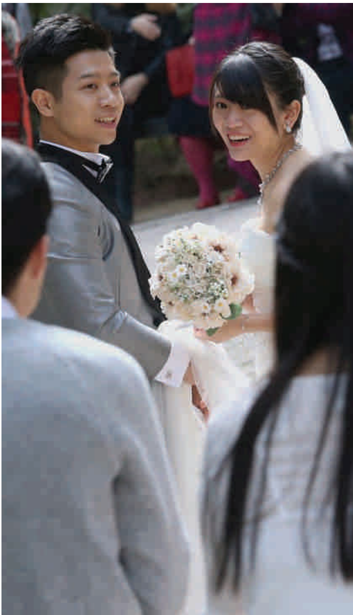
Married couples will be have the option to decide whether to elect for personal tax assessment.

Chan pledged to provide extra allowances for social security recipients, equal to two months of the standard rate comprehensive social security assistance payments, old-age allowances and disability allowance, totalling to added expenditures of HK$7 billion.