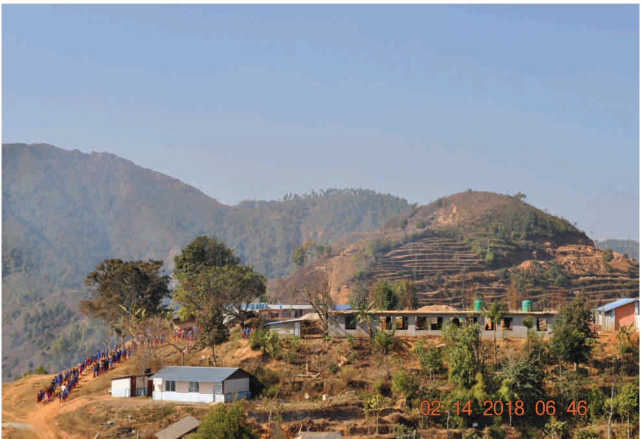
Patate School, New Classrooms