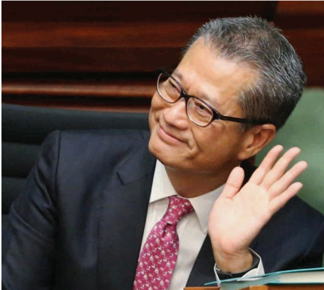
Paul Chan delivers his budget.