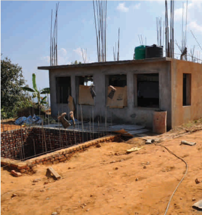
End of the new block with water tank under construction