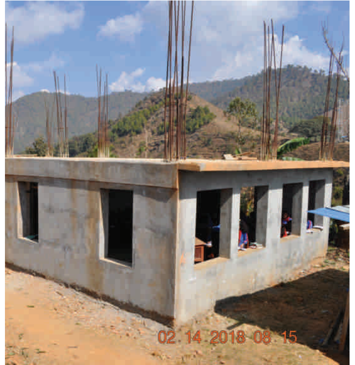
School children in four new classrooms