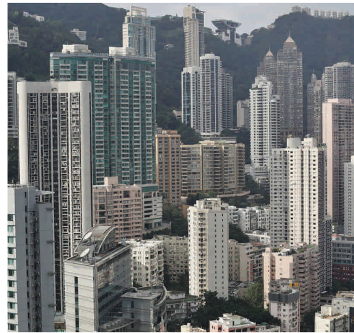
Rates will be waived for property owners for four quarters.

During his speech, Chan revealed a record HK$138 billion fiscal surplus and pledged to share nearly 40 per cent of it with the public, while investing the rest on the future and on improving public services.