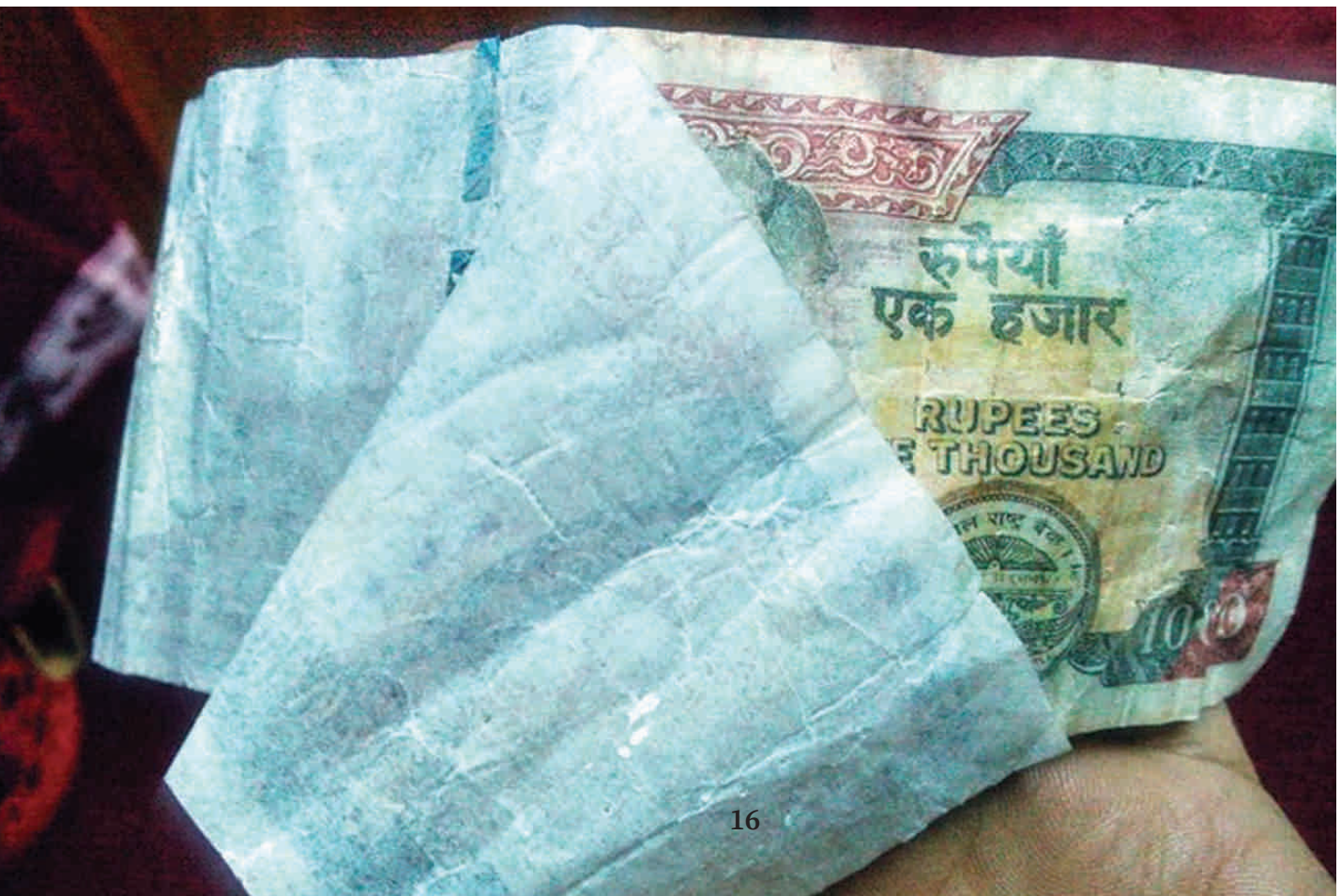
A fake Rs 1,000-note seized in Kathmandu, on Tuesday, February 27 2018.