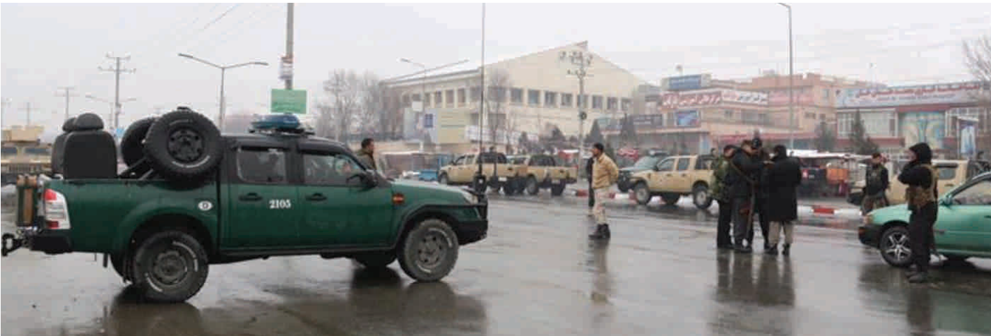
Security officials closed off roads leading to the Marshal Faheem Military academy, after an attack in Kabul